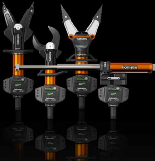
EVO 3: a full range of battery-powered cutters, spreaders, combi tools and (telescopic) rams.

If the tool idles for two minutes the motor will stop and the green light of the on/off switch will flash indicating that the tool has turned itself off. After ten minutes the flashing will stop. The tool can be quickly reactivated again by pushing the on/off switch twice.